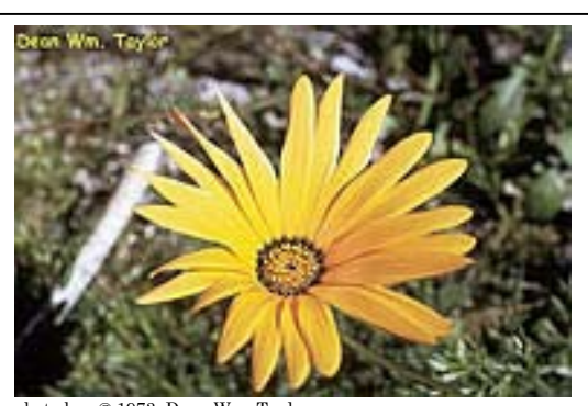
Dimorphotheca sinuata. Website: http://elib.cs.berkeley.edu/cgi/calflora_query?one=T&special=photo&where-calrecnum=2733