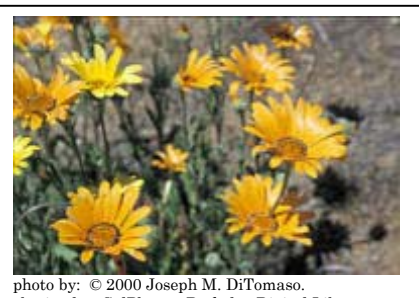
Dimorphotheca sinuata.