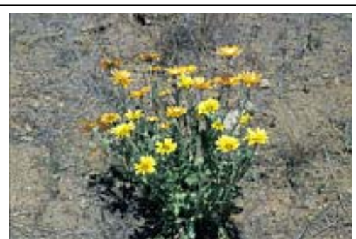
Dimorphotheca sinuata.